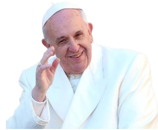
Franciscus Jorge Mario Bergoglio 13.III.2013

https://www.missionsocieties.ca/propagation-of-the-faith-spf/world-mission-sunday/