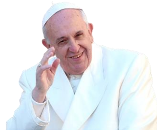
Franciscus Jorge Mario Bergoglio 13.III.2013

https://www.missionsocieties.ca/propagation-of-the-faith-spf/world-mission-sunday/